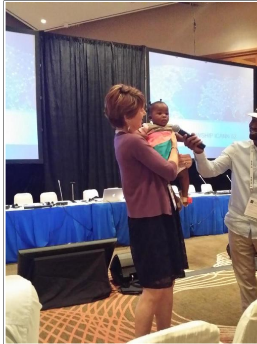
The youngest fellow of #ICANN52

The fellowship daily and newcomer sessions were helpful. This sessions showed us an idea about how to handle or understand sessions and fellows felt free to ask questions according to their interest. Additionally, we had the opportunity to meet other fellows who work in different organizations and companies around the world.